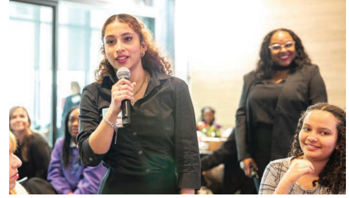
High school girls attending the Nashville Y.E.W. Forum.